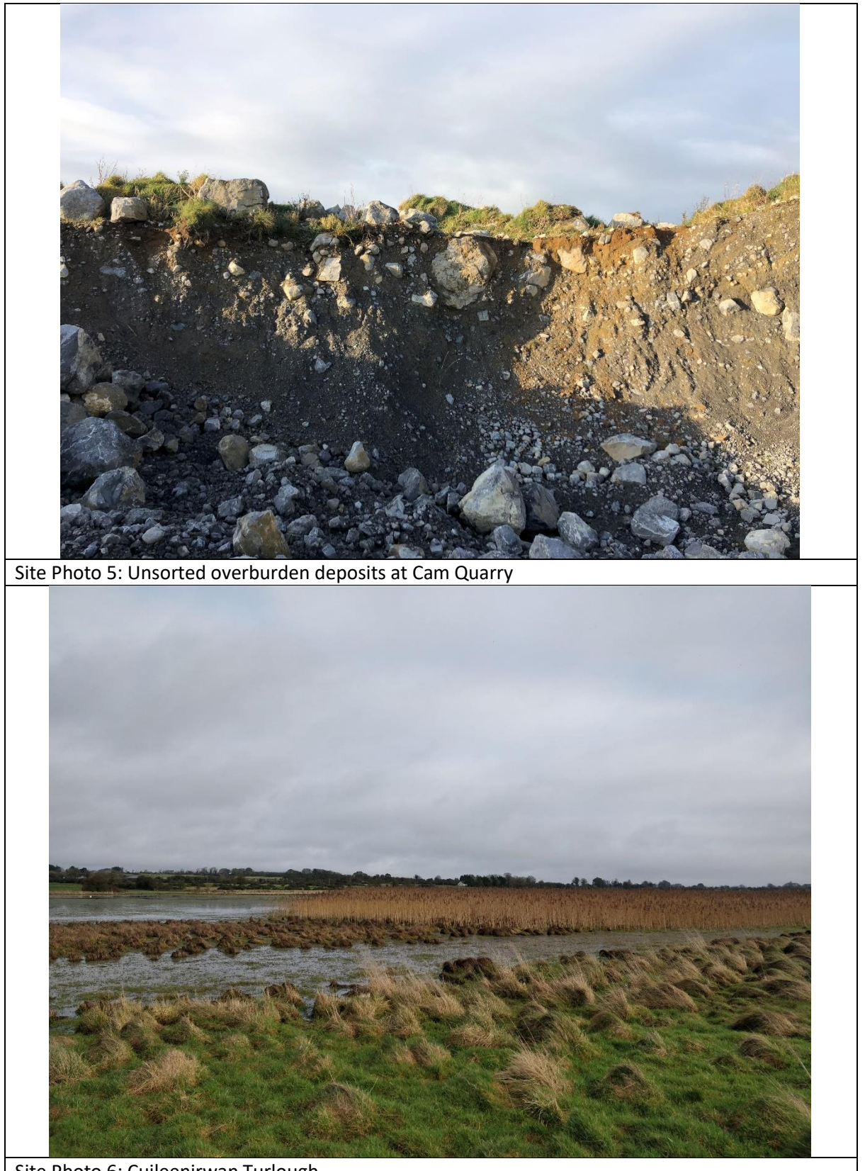
Site Photo 6: Cuileenirwan Turlough.